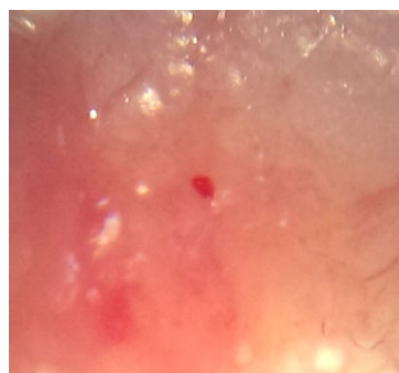
Figure 1. The ulcer caused by ibuprofen in the stomach of rats

The animals were starved for 48 hours in special cages with wire floor to induce ulcers. During this period, the animals were fed with water containing 2.0% NaCl and 2% sucrose to prevent dehydration (22). After this period, animals received orally (gavage) a single dose of 400mg/kg ibuprofen (Daroupakhsh Co.). The animals were followed for two weeks to induce ulcers (Figure 1).