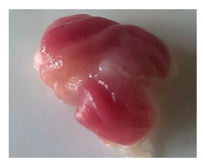
Figure 2: The stomach of normal rat

Gastric ulcer examination: After removal of the stomach from the body (Figure 2), it was cut from the large curve. Then, it was washed by normal saline and placed on the glass slides. The surface area and the number of ulcers were determined using a light microscope with a calibrated lens. Finally, the therapeutic index was calculated for each group of animals.