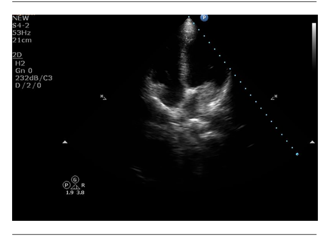
Figure 1. 2D transthoracic echocardiography shows a large heterogeneous mass with the possibility of attachment to the lateral wall of the left atrium