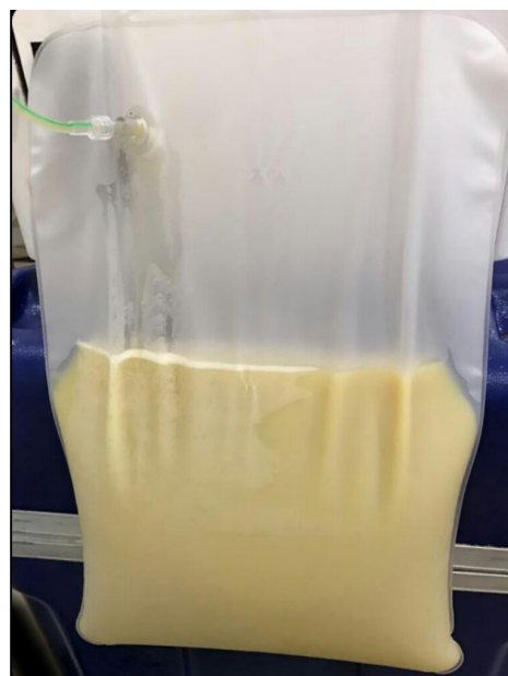
Figure 1. The patient's plasma was collected during plasmapheresis. It had a milky appearance.

We presented the case of a young T1DM pregnant woman that was controlled by insulin therapy. She presented