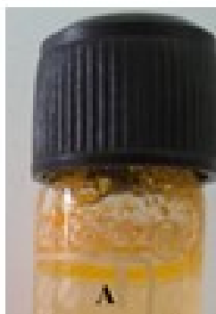
Figure 1. Water-soluble CUR-loaded CS/TPP NPs

The CUR-loaded CS/TPP NPs are water soluble. Curcumin is a water-insoluble substance that produces a non-transparent yellow solution. The CUR-loaded CS/TPP NPs are water soluble and produce a transparent yellow solution (Figure 1).