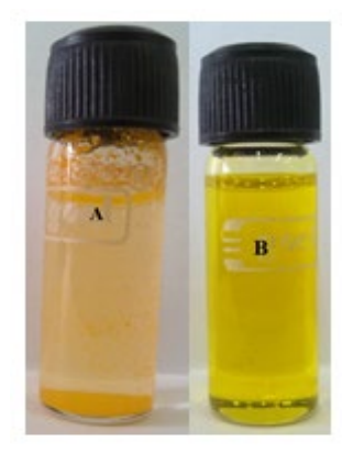
Figure 1. Water = soluble CUR-loaded CS/TPP NPs

and produce a transparent yellow solution (Figure 1).