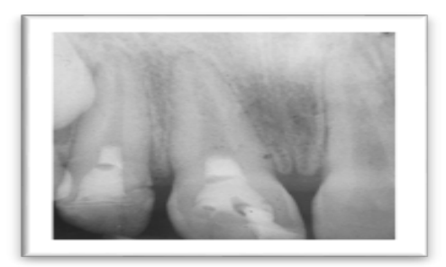
Figure 2E. Nine-months follow-up