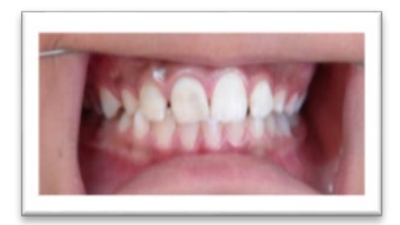
Figure 1E. Photography of the maxillary right incisors with complicated crown fracture after 18 months from trauma