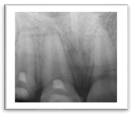
Figure 2B. Post-operative periapical radiography after cervical pulpotomy with MTA

The cavity was filled with normal saline, and a moistened cotton pellet was placed gently over it. Then the tooth was temporarily filled with Cavite (Asia Chemi Teb Co, Tehran, Iran) (Figure. 2B). A day later, temporary restoration was removed to confirm the setting of the capping material, and the tooth was restored by using acid-etch technique and the composite material (3 M ESPE, St Paul, MN) (Figure. 1D).